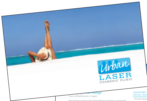
Brochure Cover Design