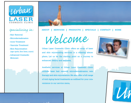
Web Page Design