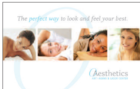
Brochure Cover Design