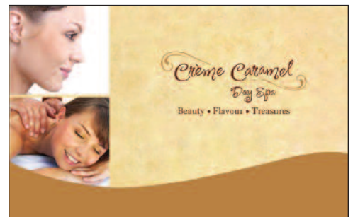
Brochure Cover Design