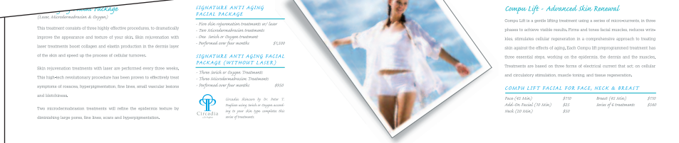
Brochure Inside Spread Design