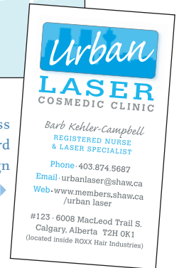
Business Card Design