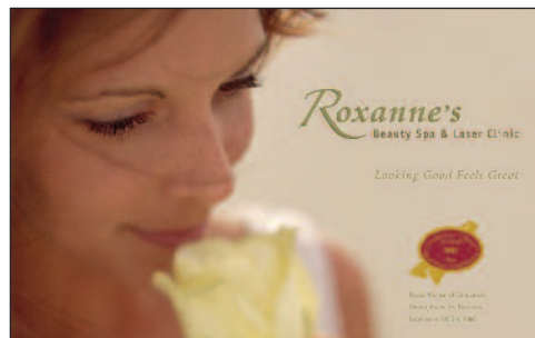
Brochure Cover Design