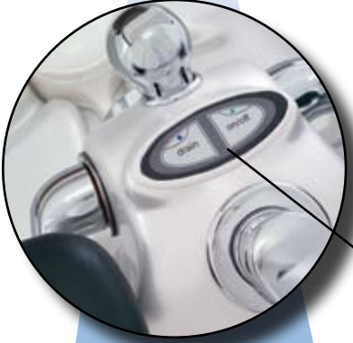
On/Off Button (shown with PDP option)