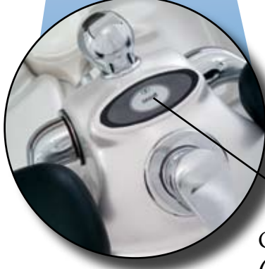
On/Off Button (shown without PDP option)