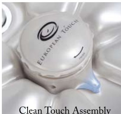
Clean Touch Assembly